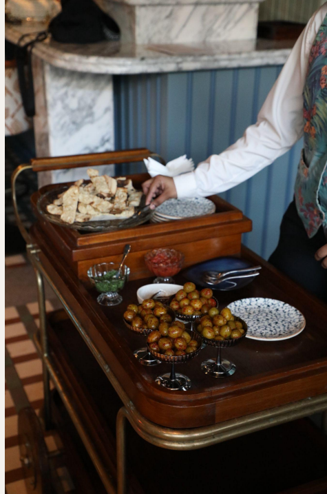
The Bruschetta Trolley